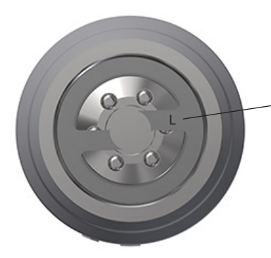
Figure 1 - Liquid or Vapor Stamp

14. Install the Retaining Ring to the end of the Stem.